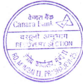
Authorised Officer / Divisional Manager Canara Bank